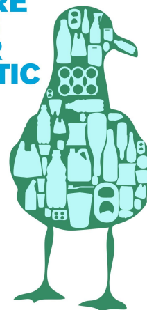
ILLUSTRATION BY JOE MORAN

Support Green Team student initiatives and join us for a free movie event - A Plastic Ocean