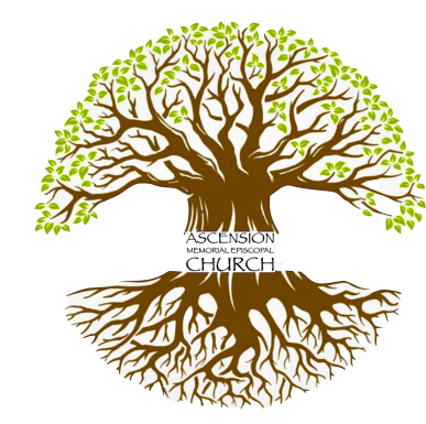
"Freely Give, Freely Receive"