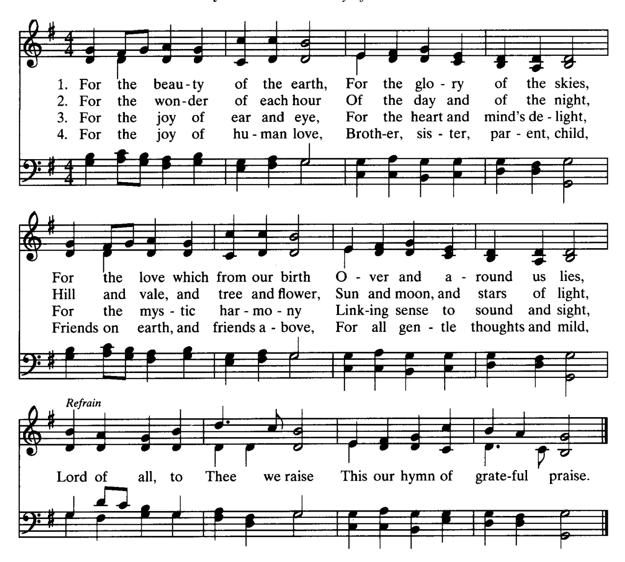
Hymn – For the beauty of the earth